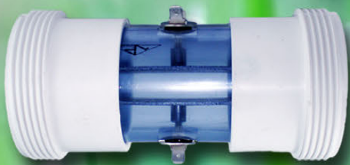
Eco-Oxidizer Titanium Cells

Wishing your pool would look sparkling clear is now a wish come true. Installing an Eco Oxidizer is a fitting way to get your wish... a fresh, clear and healthy pool without the chemicals and the fuss.